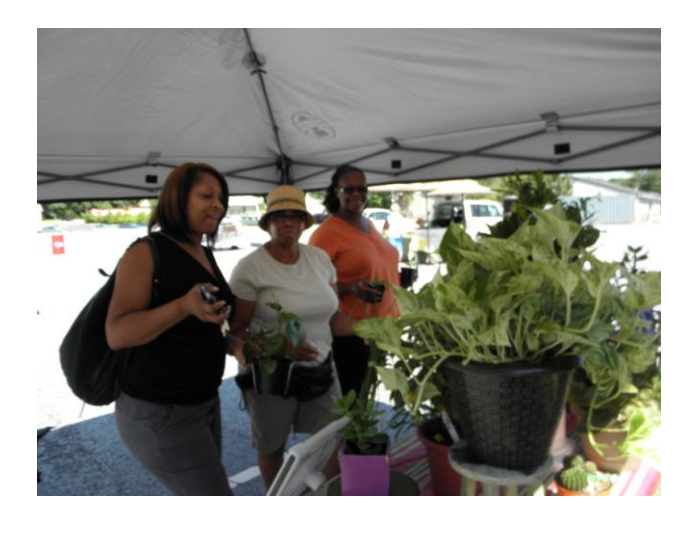
We've moved the market; it used to be held in the parking lot of the Clayton County Extension Office.

"What we hope to do is get people good deals on good produce and create an outlet for people who have backyard gardens. We have the space to offer and we want to be helpful to the community".