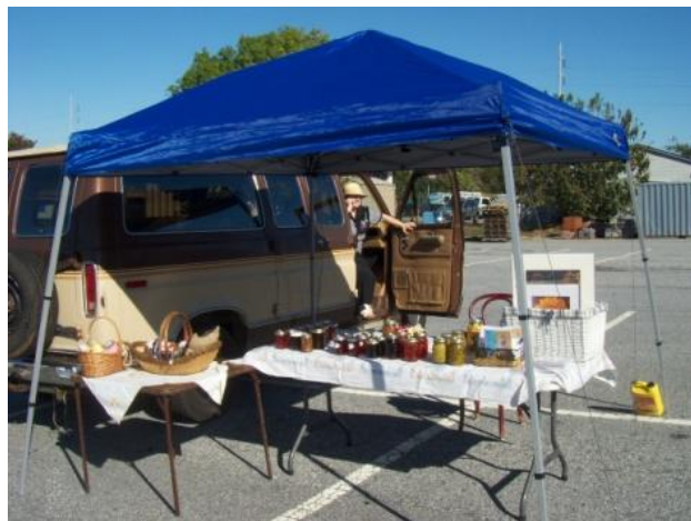
College of Agricultural and Environmental Sciences Athens THE UNIVERSITY OF GEORGIA AND FT. VALLEY STATE COLLEGE, THE U.S. DEPARTMENT OF AGRICULTURE AND COUNTIES OF THE STATE COOPERATING. The Cooperative Extension Service offers educational programs, assistance and materials to all people without regard to race, color, national origin, age, sex or disability. AN EQUAL OPPORTUNITY/AFFIRMATIVE ACTION ORGANIZATION 2009